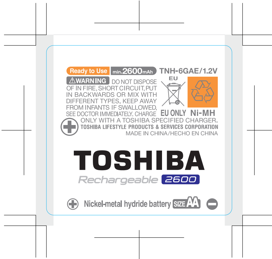
(Fig-2) Product label