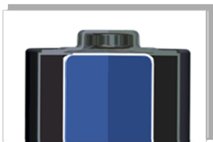
Additional View (1) Positive End